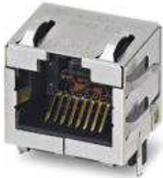
RJ45 socket insert, for PCB assembly, CAT6 A , 8-pos., shielded, with angled solder pins, 1x

Please be informed that the data shown in this PDF Document is generated from our Online Catalog. Please find the complete data in the user's documentation. Our General Terms of Use for Downloads are valid ( http://phoenixcontact.com/download )