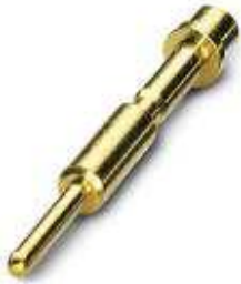
Crimp contact, turned, Single contact, Contact diameter: 1 mm, Crimp range: 0.25 mm 2 ...1 mm 2

Please be informed that the data shown in this PDF Document is generated from our Online Catalog. Please find the complete data in the user's documentation. Our General Terms of Use for Downloads are valid ( http://phoenixcontact.com/download )