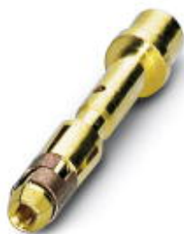
Crimp contact, turned, Single contact, Contact diameter: 1 mm, Crimp range: 0.06 mm 2 ...0.25 mm 2

Please be informed that the data shown in this PDF Document is generated from our Online Catalog. Please find the complete data in the user's documentation. Our General Terms of Use for Downloads are valid ( http://phoenixcontact.com/download )