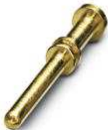
Crimp contact, turned, Single contact, Contact diameter: 2 mm, Crimp range: 4 mm 2 ...4 mm 2

Please be informed that the data shown in this PDF Document is generated from our Online Catalog. Please find the complete data in the user's documentation. Our General Terms of Use for Downloads are valid ( http://phoenixcontact.com/download )