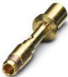
Crimp contact, turned, Single contact, Contact diameter: 2 mm, Crimp range: 0.25 mm 2 ...1 mm 2

Please be informed that the data shown in this PDF Document is generated from our Online Catalog. Please find the complete data in the user's documentation. Our General Terms of Use for Downloads are valid ( http://phoenixcontact.com/download )