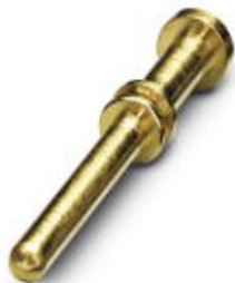
Crimp contact, turned, Single contact, Contact diameter: 2 mm, Crimp range: 0.14 mm 2 ...0.25 mm 2

Please be informed that the data shown in this PDF Document is generated from our Online Catalog. Please find the complete data in the user's documentation. Our General Terms of Use for Downloads are valid ( http://phoenixcontact.com/download )