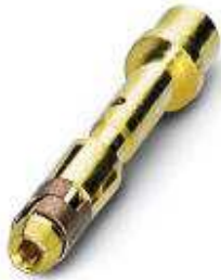
Crimp contact, turned, Single contact, Contact diameter: 1 mm, Crimp range: 0.34 mm 2 ...0.5 mm 2

Please be informed that the data shown in this PDF Document is generated from our Online Catalog. Please find the complete data in the user's documentation. Our General Terms of Use for Downloads are valid ( http://phoenixcontact.com/download )