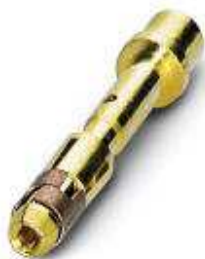
Crimp contact, turned, Single contact, Contact diameter: 1 mm, Crimp range: 0.5 mm 2 ...1 mm 2

Please be informed that the data shown in this PDF Document is generated from our Online Catalog. Please find the complete data in the user's documentation. Our General Terms of Use for Downloads are valid ( http://phoenixcontact.com/download )