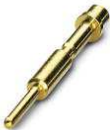
Crimp contact, turned, Single contact, Contact diameter: 1 mm, Crimp range: 0.5 mm 2 ...1 mm 2

Please be informed that the data shown in this PDF Document is generated from our Online Catalog. Please find the complete data in the user's documentation. Our General Terms of Use for Downloads are valid ( http://phoenixcontact.com/download )