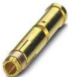
Crimp contact, turned, Contact diameter: 2 mm, Crimp range: 0.25 mm²...1 mm²

Please be informed that the data shown in this PDF Document is generated from our Online Catalog. Please find the complete data in the user's documentation. Our General Terms of Use for Downloads are valid ( http://phoenixcontact.com/download )