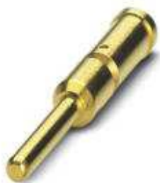
Crimp contact, turned, Contact diameter: 2 mm, Crimp range: 2.5 mm²...4 mm²

Please be informed that the data shown in this PDF Document is generated from our Online Catalog. Please find the complete data in the user's documentation. Our General Terms of Use for Downloads are valid ( http://phoenixcontact.com/download )