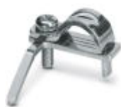
Shield connection clip for printed circuit terminal block

Components of electronic housing - ME-SAS - 2853899