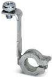
PE contact for UM-PRO panel mounting base for connecting the PCB to the DIN rail at level 2

Please be informed that the data shown in this PDF Document is generated from our Online Catalog. Please find the complete data in the user's documentation. Our General Terms of Use for Downloads are valid ( http://phoenixcontact.com/download )