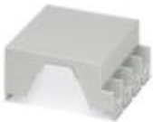
Component housing, Upper part, color: light gray, width: 90 mm, length: 99 mm, height: 38.5 mm

Electronic housing - ME 90 OT-1MSTBO KMGY - 2200523