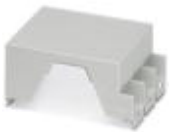
Component housing, Upper part, color: light gray, width: 67.5 mm, length: 99 mm, height: 38.5 mm

Electronic housing - ME 67,5 OT-1MSTBO KMGY - 2200522