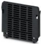
Panel mounting base, Side part, color: black, width: 9.95 mm, length: 76 mm, height: 65.7 mm