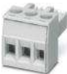
Plug component, nominal current: 16 A, rated voltage (III/2): 320 V, number of positions: 3, pitch: 5 mm, connection method: Screw connection, color: light gray, contact surface: Tin

Printed-circuit board connector - MSTBT 2,5 HC/ 3-STP GY7035 - 2200333