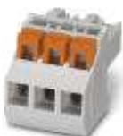
Plug component, nominal current: 16 A, rated voltage (III/2): 300 V, number of positions: 3, pitch: 5 mm, connection method: Push-in spring connection, color: light gray, contact surface: Tin

Printed-circuit board connector - PSPT 2,5/ 3-ST KMGY - 2202345