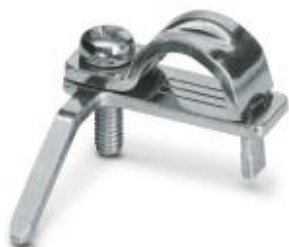
Shield connection clip for printed circuit terminal block

Please be informed that the data shown in this PDF Document is generated from our Online Catalog. Please find the complete data in the user's documentation. Our General Terms of Use for Downloads are valid ( http://phoenixcontact.com/download )