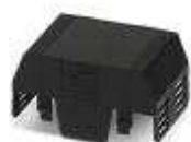
Component housing without connection opening, color: black, width: 45 mm

Housing cover - EH 45 F-C CS/ABS BK9005 - 2201766