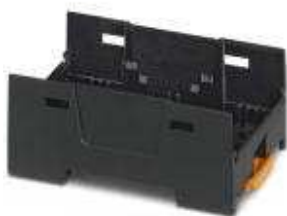
Component housing, color: black, width: 45 mm

Please be informed that the data shown in this PDF Document is generated from our Online Catalog. Please find the complete data in the user's documentation. Our General Terms of Use for Downloads are valid ( http://phoenixcontact.com/download )