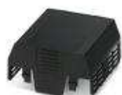
Component housing without connection opening, color: black, width: 67.5 mm

Housing cover - EH 67,5 F-C CS/ABS BK9005 - 2201775