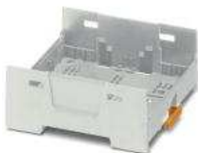
Component housing, color: gray, width: 67.5 mm

Please be informed that the data shown in this PDF Document is generated from our Online Catalog. Please find the complete data in the user's documentation. Our General Terms of Use for Downloads are valid ( http://phoenixcontact.com/download )