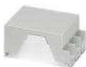
, length: 99 mm, Component housing, Upper part, color: light gray, width: 67.5 mm, height: 38.5 mm

Electronic housing - ME 67,5 OT-1MSTBO KMGY - 2200522