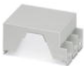
, length: 99 mm,Component housing, Upper part, color: light gray, width: 67.5 mm, height: 38.5 mm

Electronic housing - ME 67,5 OT-1MSTBO KMGY - 2200522