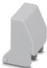
Filler plugs, for unoccupied terminal points

Please be informed that the data shown in this PDF Document is generated from our Online Catalog. Please find the complete data in the user's documentation. Our General Terms of Use for Downloads are valid ( http://phoenixcontact.com/download )