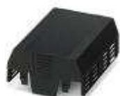
Component housing without connection opening, color: black, width: 90 mm

Housing cover - EH 90 F-C CS/ABS BK9005 - 2201776