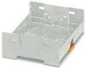
Component housing, color: gray, width: 90 mm

Please be informed that the data shown in this PDF Document is generated from our Online Catalog. Please find the complete data in the user's documentation. Our General Terms of Use for Downloads are valid ( http://phoenixcontact.com/download )