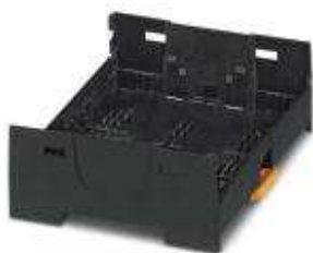
Component housing, color: black, width: 90 mm

Please be informed that the data shown in this PDF Document is generated from our Online Catalog. Please find the complete data in the user's documentation. Our General Terms of Use for Downloads are valid ( http://phoenixcontact.com/download )