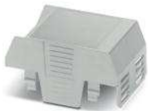
Component housing connection opening on one side, color: gray, width: 45 mm

Please be informed that the data shown in this PDF Document is generated from our Online Catalog. Please find the complete data in the user's documentation. Our General Terms of Use for Downloads are valid ( http://phoenixcontact.com/download )