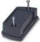
Panel mounting base, Side part, color: gray, width: 77.4 mm, length: 15 mm, height: 36.2 mm