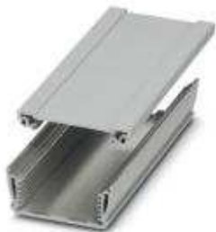
Panel mounting base, Lower part, color: aluminum color, width: 74 mm, length: 100 mm, height: 32.8 mm

Please be informed that the data shown in this PDF Document is generated from our Online Catalog. Please find the complete data in the user's documentation. Our General Terms of Use for Downloads are valid ( http://phoenixcontact.com/download )