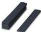
Decorative strip for HC-ALU panel mounting base

Mounting material - HC-ALU 6 DECO 150 GY - 2200915