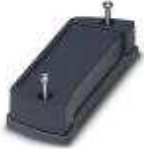
Panel mounting base, Side part, color: gray, width: 101.9 mm, length: 15 mm, height: 36.2 mm