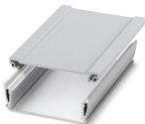
Panel mounting base, Lower part, color: aluminum color, width: 98.5 mm, length: 200 mm, height: 32.8 mm

Please be informed that the data shown in this PDF Document is generated from our Online Catalog. Please find the complete data in the user's documentation. Our General Terms of Use for Downloads are valid ( http://phoenixcontact.com/download )