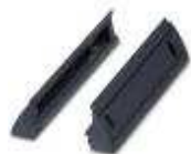
Mounting foot for panel mounting the HC-ALU panel mounting base

Mounting material - HC-ALU 6 MOUNT 200 GY - 2200913