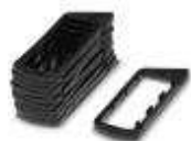
EMC seal for HC-ALU panel mounting base