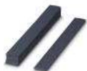
Decorative strip for HC-ALU panel mounting base

Mounting material - HC-ALU 6 DECO 200 GY - 2200916