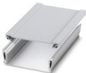
Panel mounting base, Lower part, color: aluminum color, width: 98.5 mm, length: 1000 mm, height: 32.8 mm

Please be informed that the data shown in this PDF Document is generated from our Online Catalog. Please find the complete data in the user's documentation. Our General Terms of Use for Downloads are valid ( http://phoenixcontact.com/download )