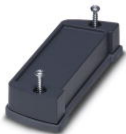
Panel mounting base, Side part, color: gray, width: 101.9 mm, length: 15 mm, height: 36.2 mm

Please be informed that the data shown in this PDF Document is generated from our Online Catalog. Please find the complete data in the user's documentation. Our General Terms of Use for Downloads are valid ( http://phoenixcontact.com/download )