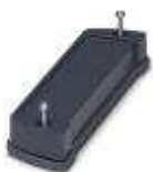
Panel mounting base, Side part, color: gray, width: 124.4 mm, length: 15 mm, height: 36.2 mm

Components of electronic housing - HC-ALU 6-100,5 COVER GY - 2200901