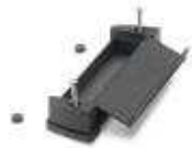
Panel mounting base, Side part, color: gray, width: 124.4 mm, length: 15 mm, height: 36.2 mm

Components of electronic housing - HC-ALU 6-100,5 DKL-COVER GY - 2201123