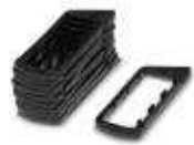
EMC seal for HC-ALU panel mounting base

Seal - HC-ALU 6-100,5 SEAL EMC - 2200909