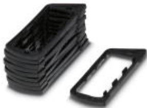
EMC seal for HC-ALU panel mounting base

Please be informed that the data shown in this PDF Document is generated from our Online Catalog. Please find the complete data in the user's documentation. Our General Terms of Use for Downloads are valid ( http://phoenixcontact.com/download )