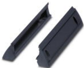
Mounting foot for panel mounting the HC-ALU panel mounting base

Please be informed that the data shown in this PDF Document is generated from our Online Catalog. Please find the complete data in the user's documentation. Our General Terms of Use for Downloads are valid ( http://phoenixcontact.com/download )