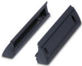
Mounting foot for panel mounting the HC-ALU panel mounting base

Please be informed that the data shown in this PDF Document is generated from our Online Catalog. Please find the complete data in the user's documentation. Our General Terms of Use for Downloads are valid ( http://phoenixcontact.com/download )