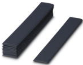
Decorative strip for HC-ALU panel mounting base

Please be informed that the data shown in this PDF Document is generated from our Online Catalog. Please find the complete data in the user's documentation. Our General Terms of Use for Downloads are valid ( http://phoenixcontact.com/download )