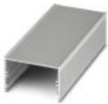
Panel mounting base, Upper part, color: aluminum color, width: 75 mm, length: 42.5 mm, height: 43.1 mm