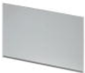
Panel mounting base, Front plate, color: aluminum color, width: 101.8 mm, length: 42.5 mm, height: 2 mm