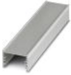
Panel mounting base, Upper part, color: aluminum color, width: 45 mm, length: 42.5 mm, height: 28.1 mm