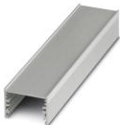
Panel mounting base, Upper part, color: aluminum color, width: 45 mm, length: 25 mm, height: 28.1 mm

Please be informed that the data shown in this PDF Document is generated from our Online Catalog. Please find the complete data in the user's documentation. Our General Terms of Use for Downloads are valid ( http://phoenixcontact.com/download )