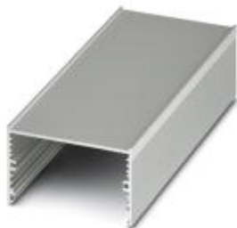
Panel mounting base, Upper part, color: aluminum color, width: 25 mm, height: 43.1 mm

Please be informed that the data shown in this PDF Document is generated from our Online Catalog. Please find the complete data in the user's documentation. Our General Terms of Use for Downloads are valid ( http://phoenixcontact.com/download )