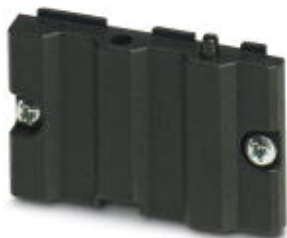
Panel mounting base, Side part, color: black, width: 45.4 mm, length: 9 mm, height: 27.5 mm

Please be informed that the data shown in this PDF Document is generated from our Online Catalog. Please find the complete data in the user's documentation. Our General Terms of Use for Downloads are valid ( http://phoenixcontact.com/download )