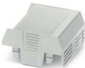
Component housing connection opening on one side, color: gray, width: 67.5 mm

Please be informed that the data shown in this PDF Document is generated from our Online Catalog. Please find the complete data in the user's documentation. Our General Terms of Use for Downloads are valid ( http://phoenixcontact.com/download )