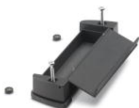
Panel mounting base, Side part, color: gray, width: 124.4 mm, length: 15 mm, height: 36.2 mm

Please be informed that the data shown in this PDF Document is generated from our Online Catalog. Please find the complete data in the user's documentation. Our General Terms of Use for Downloads are valid ( http://phoenixcontact.com/download )