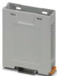
Component housing, color: gray, width: 22.5 mm

Please be informed that the data shown in this PDF Document is generated from our Online Catalog. Please find the complete data in the user's documentation. Our General Terms of Use for Downloads are valid ( http://phoenixcontact.com/download )