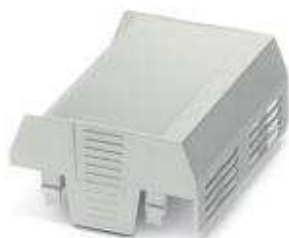
Component housing connection opening on one side, color: gray, width: 90 mm

Please be informed that the data shown in this PDF Document is generated from our Online Catalog. Please find the complete data in the user's documentation. Our General Terms of Use for Downloads are valid ( http://phoenixcontact.com/download )