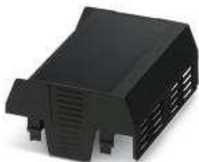
Component housing connection opening on one side, color: black, width: 90 mm

Please be informed that the data shown in this PDF Document is generated from our Online Catalog. Please find the complete data in the user's documentation. Our General Terms of Use for Downloads are valid ( http://phoenixcontact.com/download )