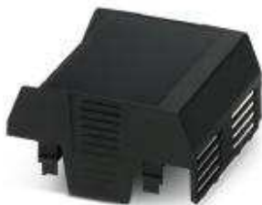
Component housing connection opening on one side, color: black, width: 67.5 mm

Please be informed that the data shown in this PDF Document is generated from our Online Catalog. Please find the complete data in the user's documentation. Our General Terms of Use for Downloads are valid ( http://phoenixcontact.com/download )