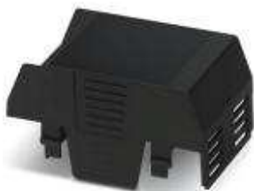
Component housing connection opening on one side, color: black, width: 45 mm

Please be informed that the data shown in this PDF Document is generated from our Online Catalog. Please find the complete data in the user's documentation. Our General Terms of Use for Downloads are valid ( http://phoenixcontact.com/download )