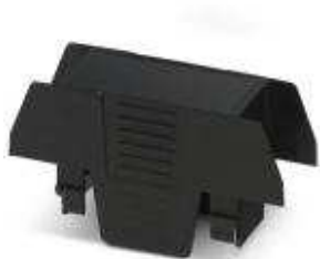
Component housing connection opening on both sides, color: black, width: 22.5 mm

Please be informed that the data shown in this PDF Document is generated from our Online Catalog. Please find the complete data in the user's documentation. Our General Terms of Use for Downloads are valid ( http://phoenixcontact.com/download )