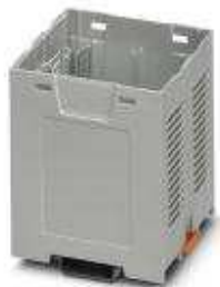
Component housing, color: gray, width: 67.5 mm

Please be informed that the data shown in this PDF Document is generated from our Online Catalog. Please find the complete data in the user's documentation. Our General Terms of Use for Downloads are valid ( http://phoenixcontact.com/download )