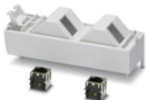
Connection technology carrier for RJ45 connection, pre-assembled with cover and release lever; incl. fitted cover and 2 x RJ45 connector plugs

Please be informed that the data shown in this PDF Document is generated from our Online Catalog. Please find the complete data in the user's documentation. Our General Terms of Use for Downloads are valid ( http://phoenixcontact.com/download )