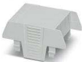
Component housing connection opening on one side, color: gray, width: 45 mm

Please be informed that the data shown in this PDF Document is generated from our Online Catalog. Please find the complete data in the user's documentation. Our General Terms of Use for Downloads are valid ( http://phoenixcontact.com/download )